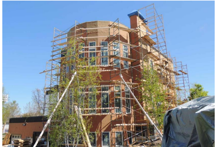
WrapShield RS Rain Screen 3mm is an all-in-one water resistive barrier and air barrier. The unique factory installed integrated tape helps to ensure proper shingled installation.

The simple and easy-to-install two component flashing system: VaproFlashing pre-cut 11 3/4" rolls and VaproLiqui-Flash eliminated the need for the installer to purchase additional tapes to flash rough opening and windows.