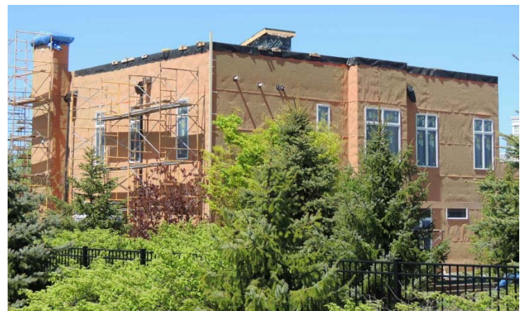
All rough openings and windows were flashed using VaproShield's two component system: VaproLiqui-Flash (gray) and VaproFlashing (installed behind penetration).